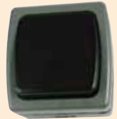
TIM-B1 Push Button