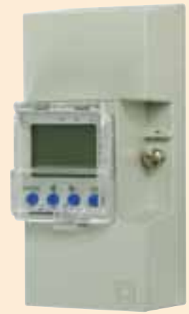
TIM-D1 and Enclosure TIM-E1