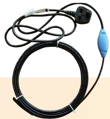
PW-06 with built-in thermostat and UK plug