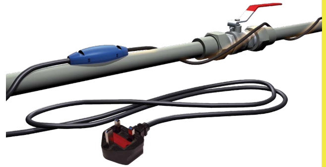
PW Water Pipe Freeze Protection Cable a low price for peace of mind