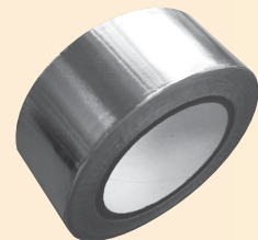
AL50 Aluminium Tape for use with plastic pipes