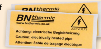
PF-L Caution Labels applied to the exterior of the insulation