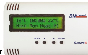
CX6 Wall Controller