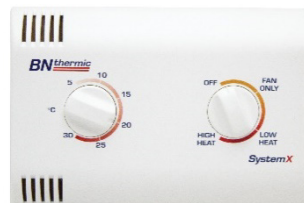
CX1 Wall Controller