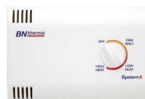
CX3 Wall Controller